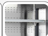
S/S shelves resting on blocks anchored to the sidewalls