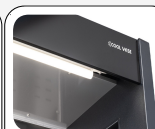
Interior LED light